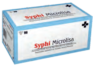
07 SYPHI MICROLISA