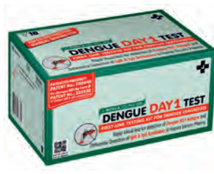
08 DENGUE DAY 1 TEST