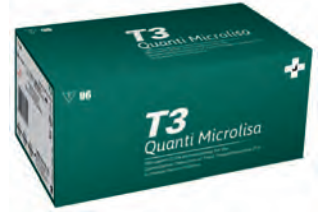
15 T3 QUANTI MICROLISA