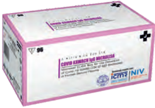
25 COVID KAWACH IgG MICROLISA