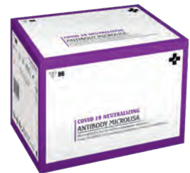
24 COVID 19 NEUTRALIZING ANTIBODY MICROLISA