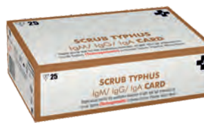
20 SCRUB TYPHUS IgM/IgG/IgA CARD