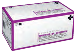
26 COVID 19 (IgM+ IgG+IgA) MICROLISA