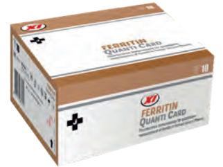
13 FERRITIN QUANTI CARD