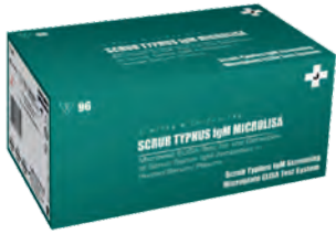
13 SCRUB TYPHUS IgM MICROLISA