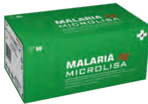
08 MALARIA Ag MICROLISA