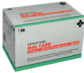
14 ADVANTAGE MAL CARD