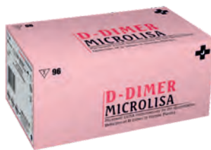
23 D-DIMER MICROLISA