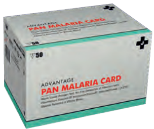
16 ADVANTAGE PAN MALARIA CARD