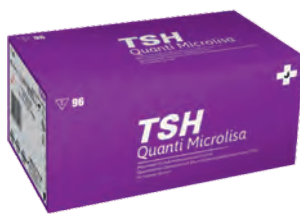
17 TSH QUANTI MICROLISA