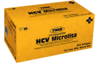
03 HCV MICROLISA