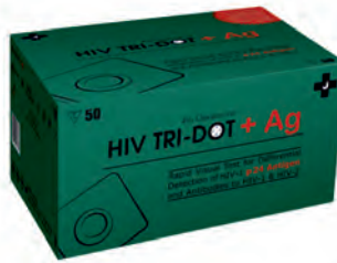
02 HIV TRI-DOT+Ag