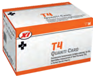
03 T4 QUANTI CARD