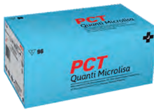
20 PCT QUANTI MICROLISA