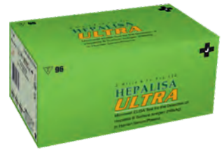
06 HEPALISA ULTRA