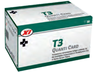
04 T3 QUANTI CARD