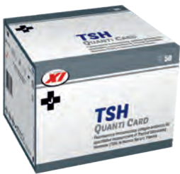
02 TSH QUANTI CARD