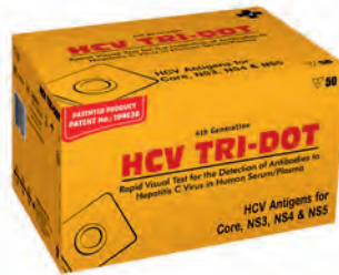
05 HCV TRI-DOT