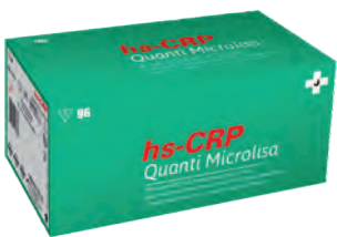
22 hs-CRP QUANTI MICROLISA