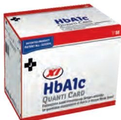
05 HbA1c QUANTI CARD