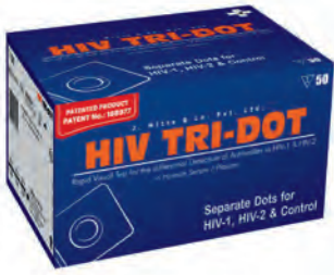
01 HIV TRI-DOT