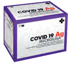
27 COVID-19 Ag MICROLISA