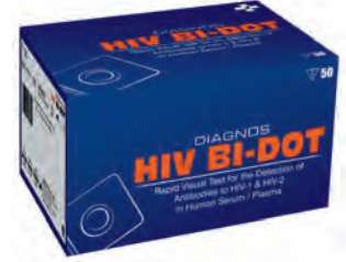
03 DIAGNOS HIV BI-DOT