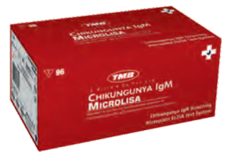
12 CHIKUNGUNYA IgM MICROLISA