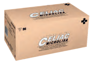
21 CELIAC MICROLISA