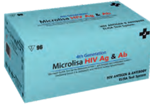
02 MICROLISA HIV Ag & Ab