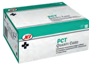
12 PCT QUANTI CARD