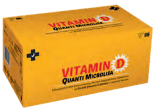
19 VITAMIN D QUANTI MICROLISA