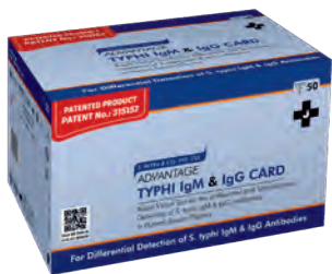
19 ADVANTAGE TYPHI IgM & IgG CARD