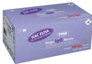
11 DENGUE IgG MICROLISA