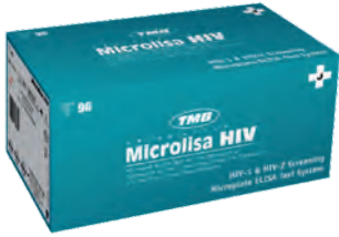
01 MICROLISA HIV