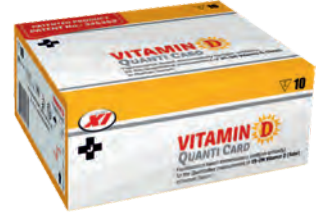
10 VITAMIN D QUANTI CARD