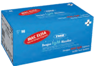
10 DENGUE IgM MICROLISA