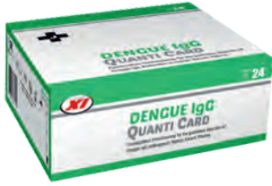
08 DENGUE IgG QUANTI CARD