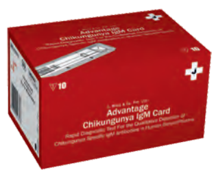
12 ADVANTAGE CHIKUNGUNYA IgM CARD