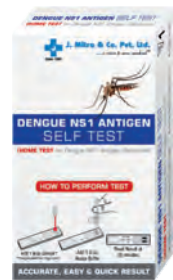
09 DENGUE NS1 ANTIGEN SELF TEST