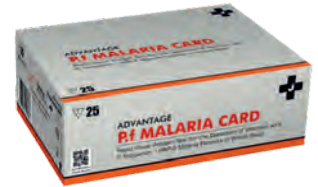
18 ADVANTAGE P.F MALARIA CARD