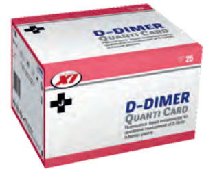
01 D-DIMER QUANTI CARD