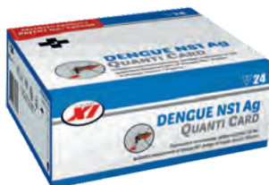
06 DENGUE NS1 Ag QUANTI CARD