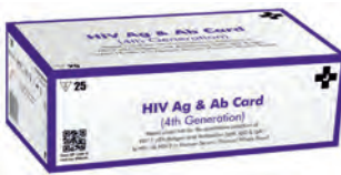
04 HIV Ag & Ab CARD GEN4