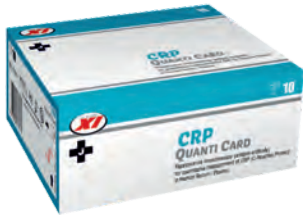
11 CRP QUANTI CARD