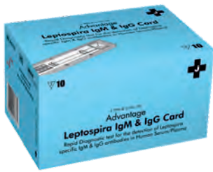
13 ADVANTAGE LEPTOSPIRA IgM & IgG CARD