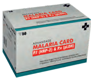
17 ADVANTAGE MALARIA CARD