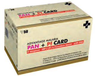
15 ADVANTAGE MALARIA PAN + PF CARD