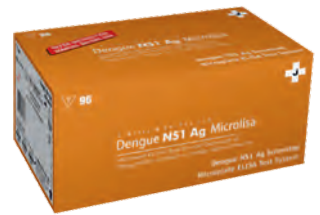
09 DENGUE NS1 Ag MICROLISA