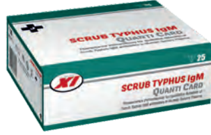
09 SCRUB TYPHUS IgM QUANTI CARD