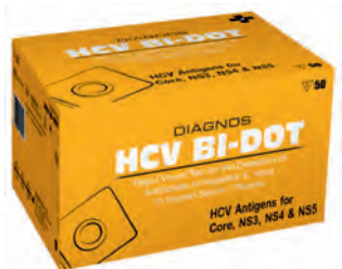
06 DIAGNOS HCV BI-DOT