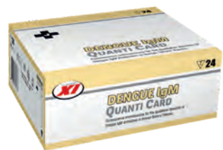
07 DENGUE IgM QUANTI CARD