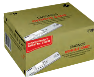
11 DIAGNOS DENGUE CARD