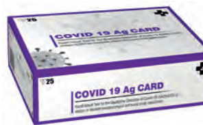
23 COVID 19 Ag CARD