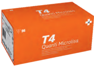
16 T4 QUANTI MICROLISA