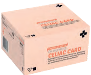
22 DIAGNOS CELIAC CARD