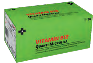
18 VITAMIN B12 QUANTI MICROLISA