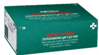
21 SCRUB TYPHUS (TSUTSUGAMUSHI) IgM & IgG CARD