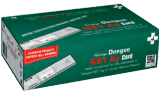
10 ADVANTAGE DENGUE NS1 Ag CARD