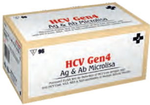
04 HCV GEN4 Ag & Ab MICROLISA