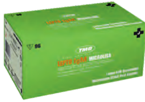
14 LEPTO IgM MICROLISA