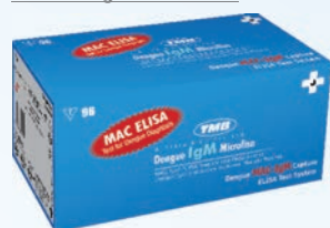
DENGUE IgM MICROLISA