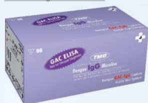
DENGUE IgG MICROLISA