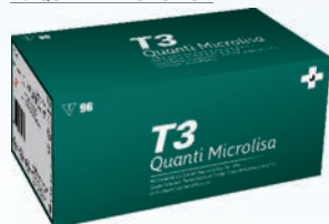
T3 QUANTI MICROLISA