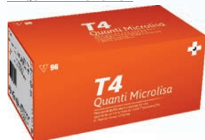
T4 QUANTI MICROLISA