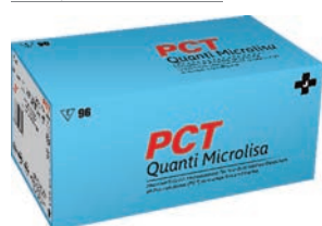
PCT QUANTI MICROLISA