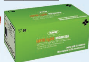
LEPTO IgM MICROLISA