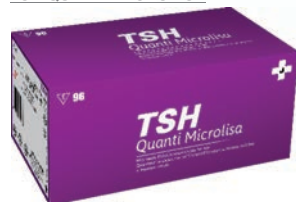
TSH QUANTI MICROLISA