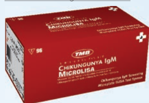
CHIKUNGUNYA IgM MICROLISA