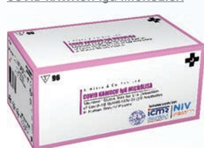
COVID KAWACH IgG MICROLISA