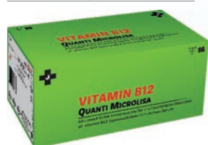
VITAMIN B12 QUANTI MICROLISA