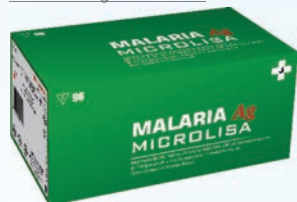
MALARIA Ag MICROLISA