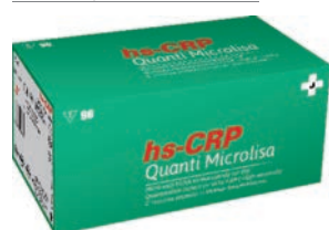
hs-CRP QUANTI MICROLISA