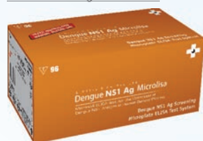
DENGUE NS1Ag MICROLISA